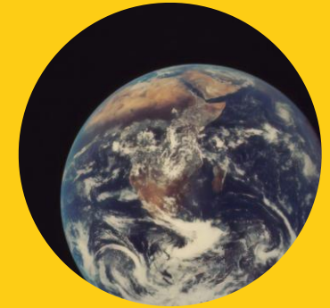
CIRCULAR FOOD SYSTEMS